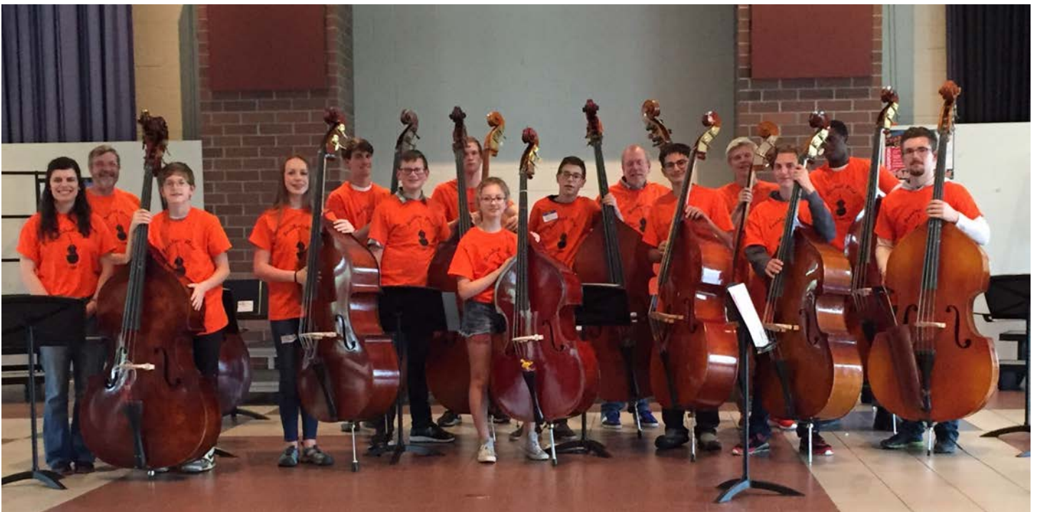
BassFest West May 19, 2018 at East Rockford Middle School

Dates for the Summer MASTA Board Retreat, the Studio Teacher Workshop, and the Cello Festival will be announced soon. Please check astamichigan.org for more info!