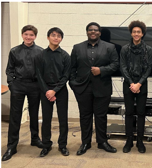
The KJSO String Quartet