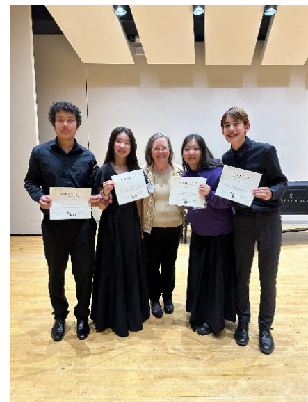
The Smith Quartet